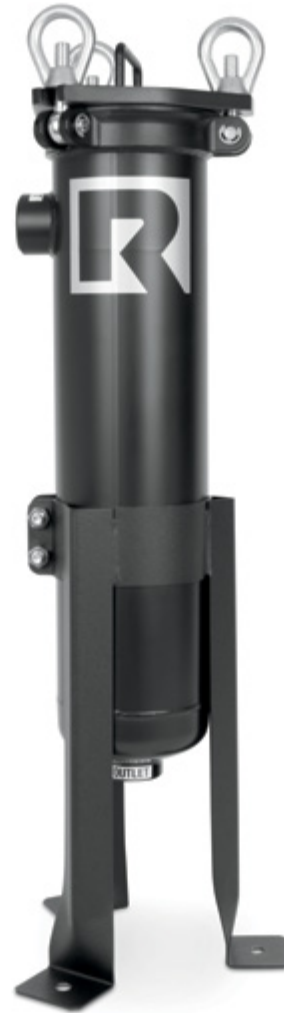
Model 6. Carbon steel.