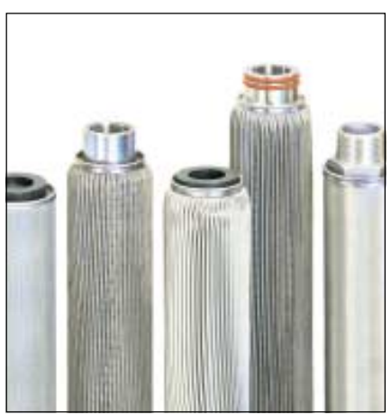
See pages 158-174 for more information on our cartridges.