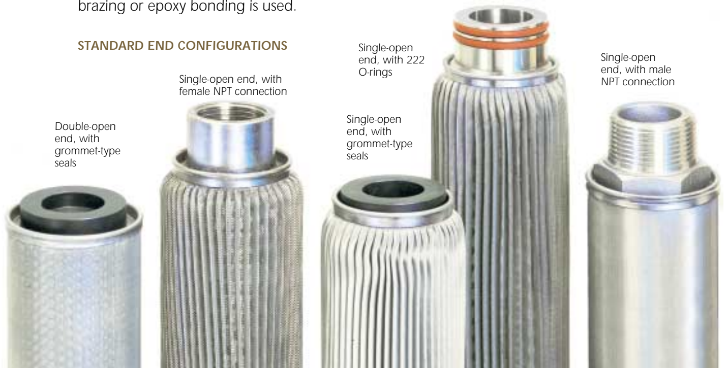
Double-open end, with grommet-type seals